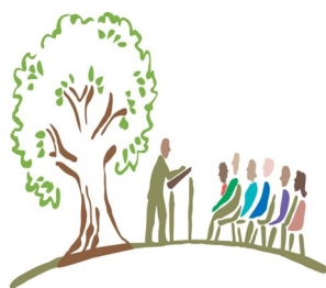
Outdoor Worship at Perrin Park

Bring a lawn chair for yourself and a salad, vegetable and/or dessert to share . (Meat, drinks and setups will be provided.)